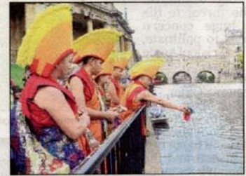
Destroy: The multi-coloured sand design is consigned to oblivion near Pulteney Bridge, left