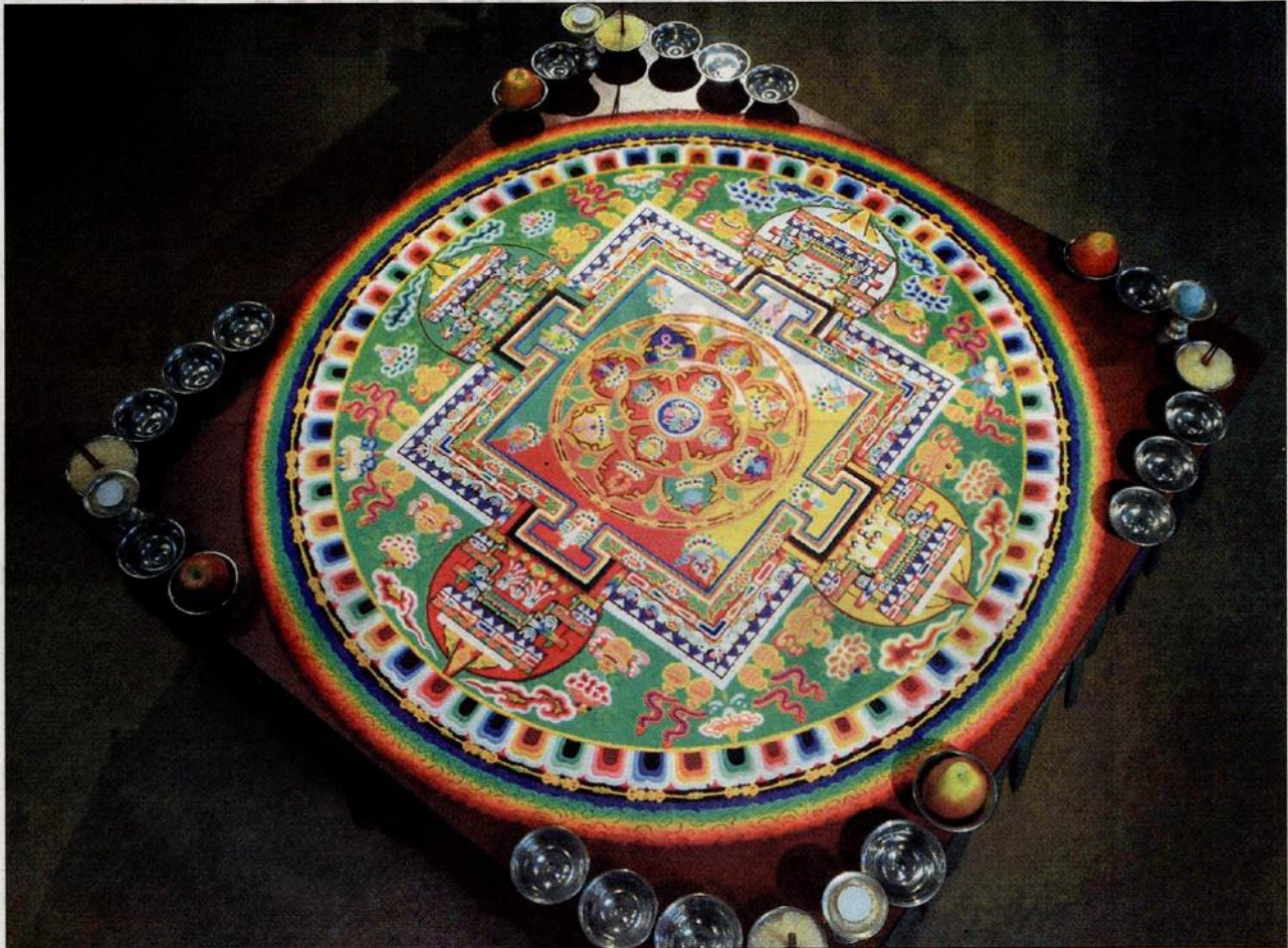
Mandala: The finished work of art before it was ritually poured into the River Avon

A bizarre display of Asian monk art took place in Bath.